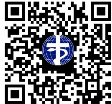
REGISTRATION FORM [ USE GOOGLE LENS TO SCAN ]