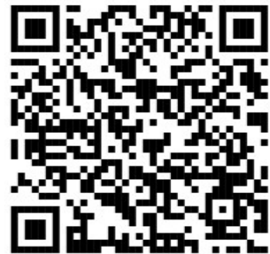
UPI PAYMENT LINK [ USE UPI APP TO SCAN ]

IF YOU HAVE ANY QUERIES DURING THE REGISTRATION PROCESS FEEL FREE TO SEND US AN EMAIL TO 'officefiamcindia@gmail.com' WITH YOUR NAME AND PHONE NUMBER AND OUR TEAM MEMBERS WILL GET IN TOUCH WITH YOU SHORTLY.