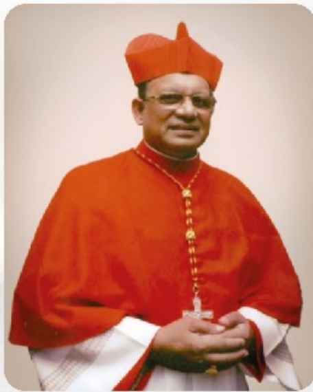
PATRON CARDINAL OSWALD GRACIAS